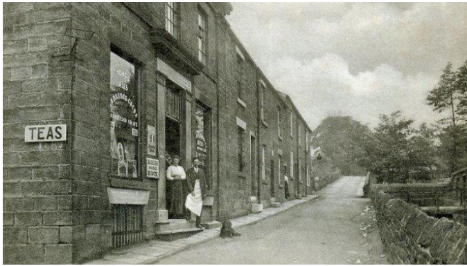
Historic Barrow Bridge