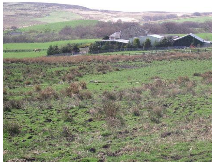
Gilligants Farm, Smithills